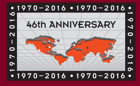
The Strength of Experience.

The accuracy of our selection process is backed up by our strong success rate. Almost all of our successful placements have remained throughout their contract period, many of them advancing to the upper echelons of renowned corporations in the industry.